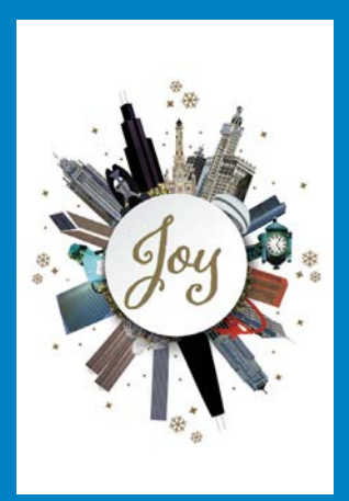
Around the World - 380120 LPCS Inside: Wishing You A World Of Joy