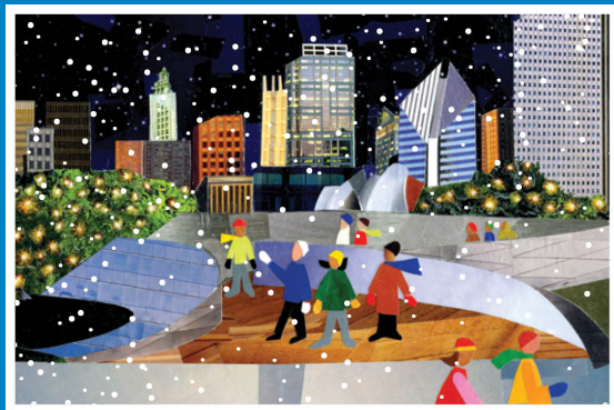
Chicago Riverfront - 390019 TV

Transplant Village and Eclectik are partnering for your 2020 holiday cards. Eclectik's colorful and unique holiday card collection is the perfect tool to recognize your clients and friends while building and maintaining those personal relationships throughout the year.