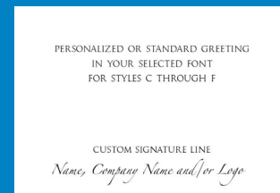
Inside of Card - Bottom