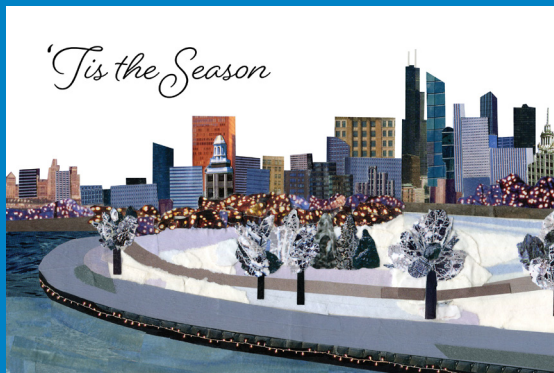
Chicago Kid Skaters - 390119 TV

Inside: Best Wishes for a Happy Holiday Season