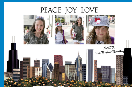
Chicago Holiday Photo Card - 350520 TV

Personalize your card today with your favorite photo, selfie, name and send some holiday fun to those near and dear!