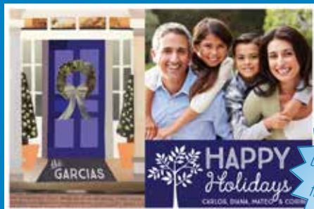
Welcome Home - 351418 LPCS Front: Happy Holidays

Personalize your card today with your favorite photo, selfie, name and send some holiday fun to those near and dear! This card also uses the LPCS Tree on the front of Card!