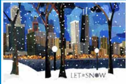
Chicago Branch - 320118 LPCS Inside: Reaching out with Good Wishes for the Holidays

Lincoln Park Community Services and Eclectik are partnering for your 2018 holiday cards. Eclectik's colorful and unique holiday card collection is the perfect tool to recognize your clients and friends while building and maintaining those personal relationships throughout the year.