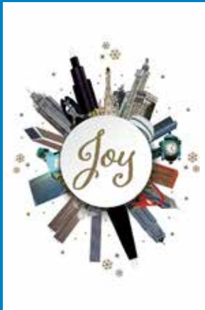
Chicago Winter Globe - 360118 LPCS Inside: Wishing you a world of joy this holiday season