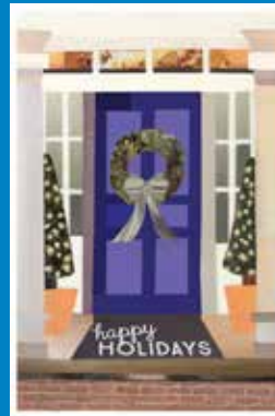
Welcome Home - 351518 LPCS Inside: May your home be filled with the warmth of the holiday season

Visit Eclectik Design at www.eclectik.com Or contact Eclectik at (312) 690-3181 or order@eclectik.com to inquire about ordering Lincoln Park Community Services holiday cards and additional card options.