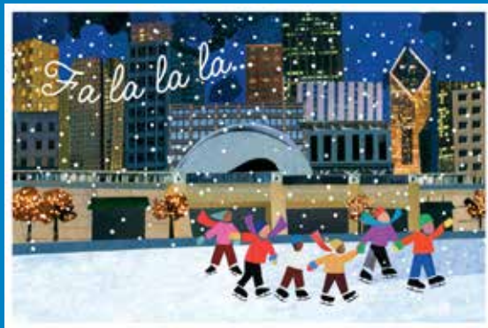
Chicago Kid Skaters - 390119 TV

Inside: Best Wishes for a Happy Holiday Season