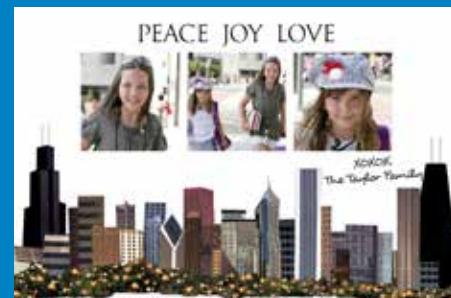
Chicago Holiday Photo Card - 350519 TV

Personalize your card today with your favorite photo, selfie, name and send some holiday fun to those near and dear!