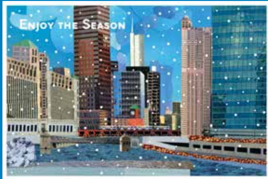
Chicago Riverfront - 390019 TV

Transplant Village and Eclectik are partnering for your 2019 holiday cards. Eclectik's colorful and unique holiday card collection is the perfect tool to recognize your clients and friends while building and maintaining those personal relationships throughout the year.