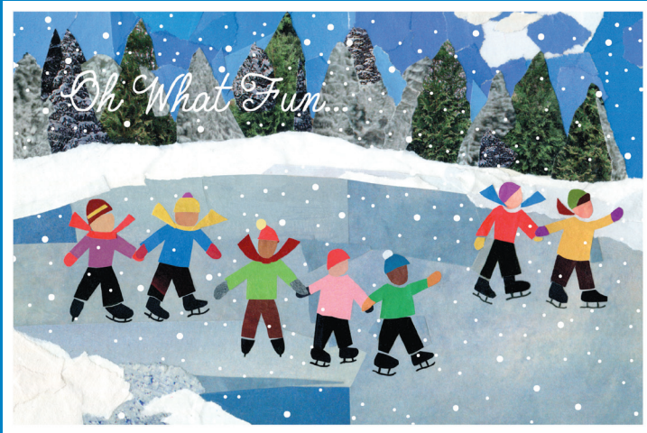
Playtime - 390219 CS

Eclectik's colorful and unique holiday card collection is the perfect way to recognize your clients and friends while building and maintaining those personal relationships throughout the year.