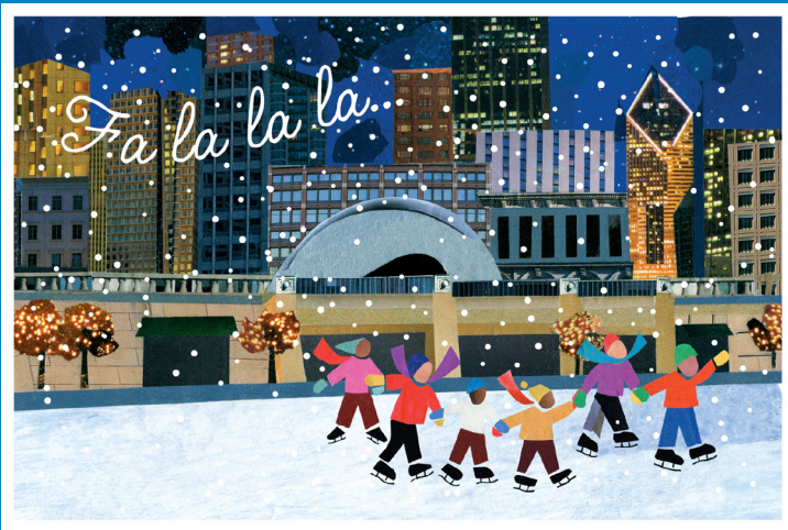
Chicago Kid Skaters - 390119 CS

Inside: Wishing You Happiness and Cheer Throughout the Year